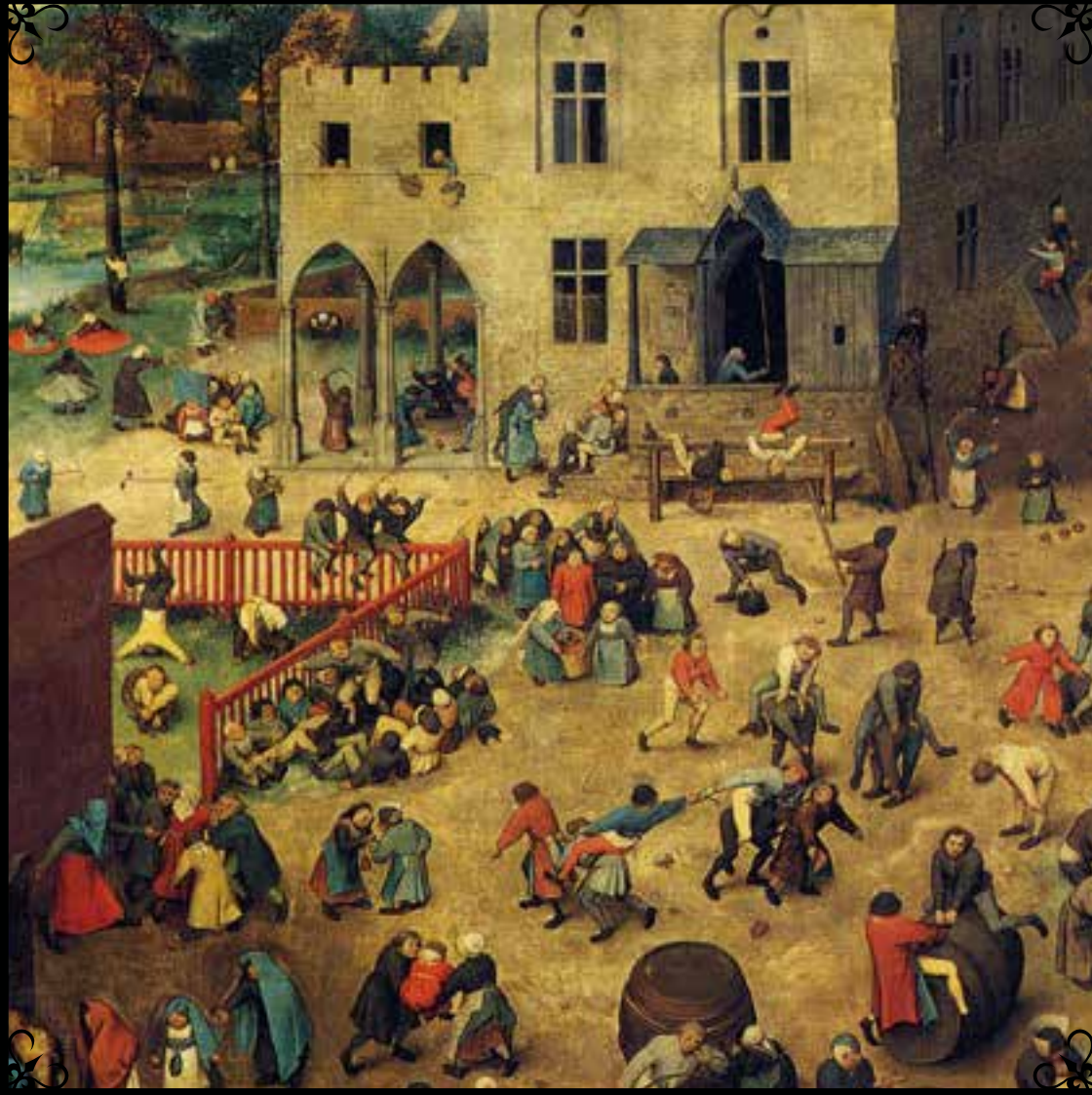
“Children’s Games” Pieter Bruegel the Elder, Flemish (1560)