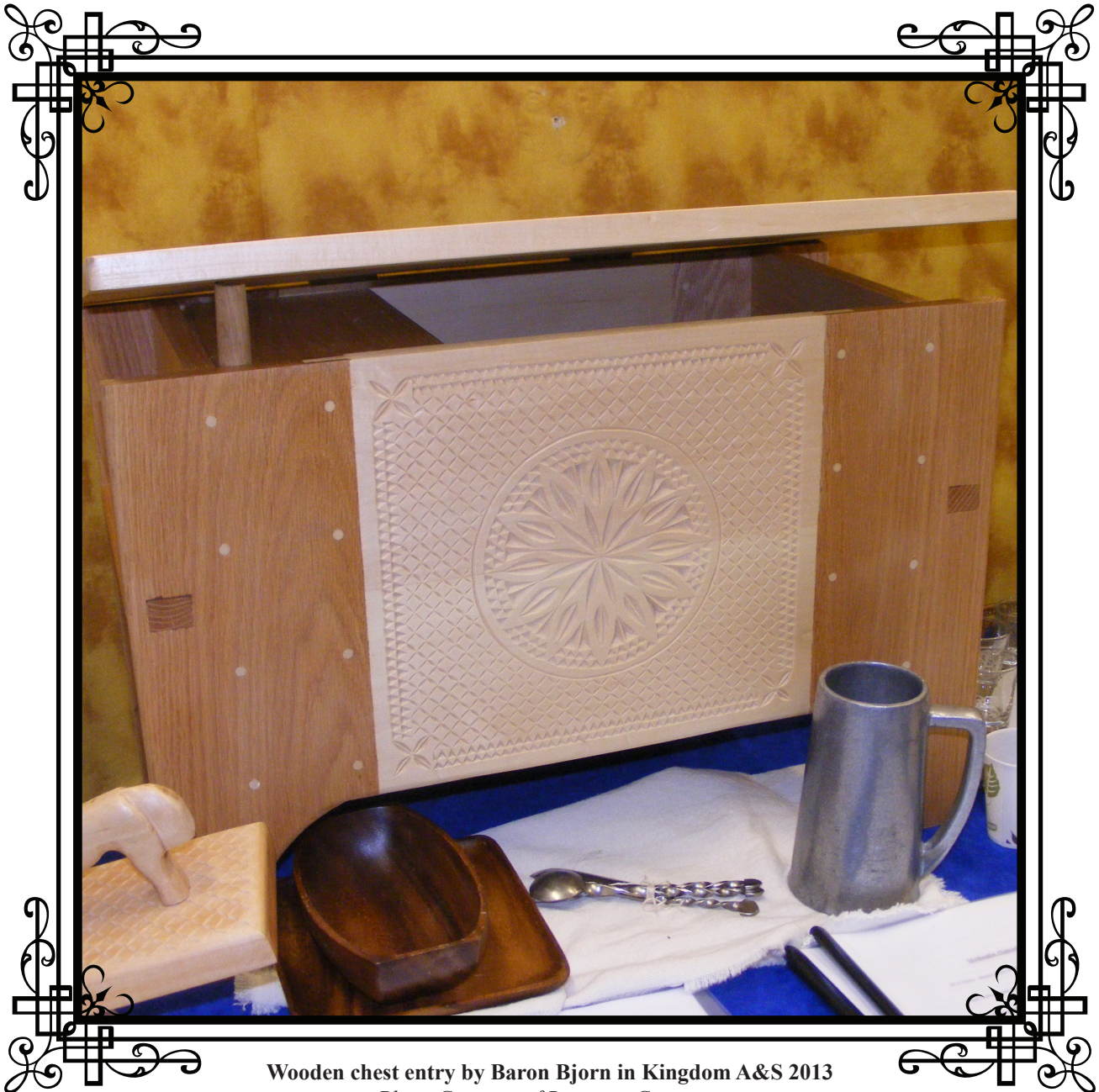
Wooden chest entry by Baron Bjorn in Kingdom A&S 2013