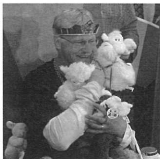
His Highness collects a peace offering for the Baron of Loch Salann on behalf of the Barony of Arn Hold

War Points: One War Point will be awarded for each area: Heavy Fighting, Rapier, Thrown Weapons, and Arts & Sciences. This war can only be won with the efforts of all!