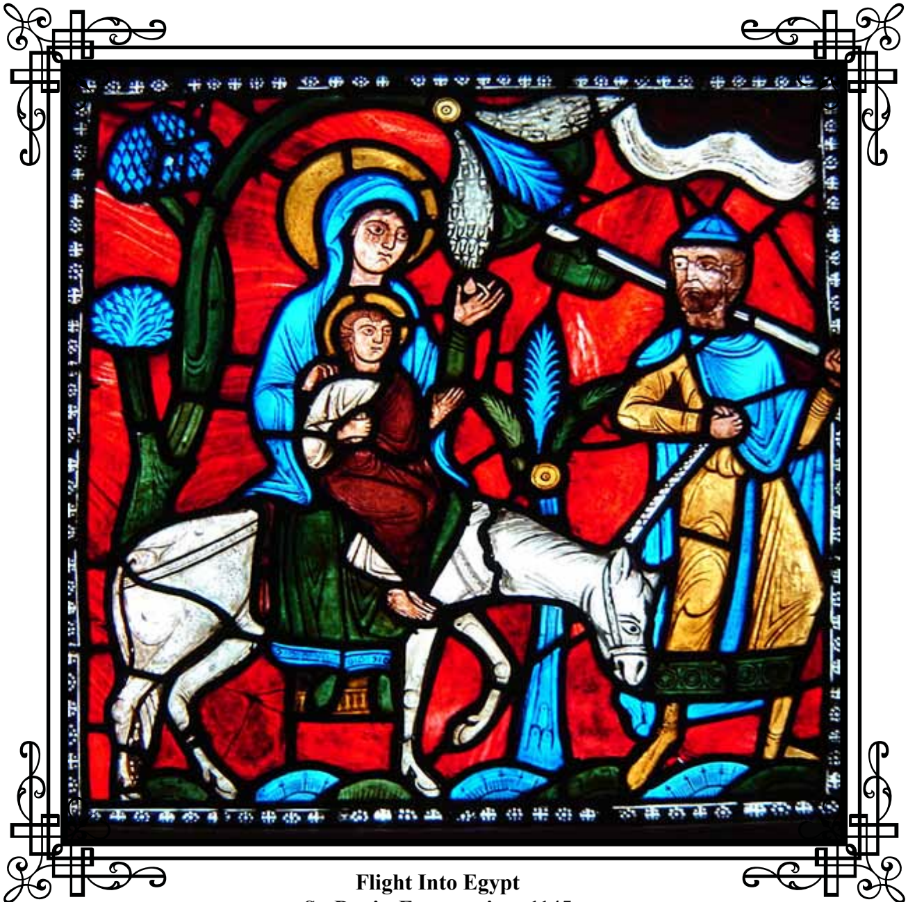
Flight Into Egypt St. Denis, France, circa 1145