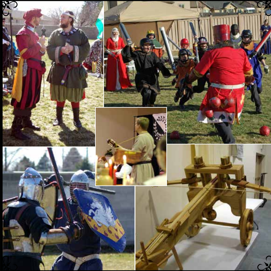
Defenders Tournament 2014